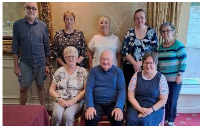
Tipperary OPC Training 2022 MacMahon

The key role of the members is to provide the voice of older people to support the Alliance at strategic level in the delivery of its actions and to co design solutions in response to barriers and challenges. Membership is made up of individual older people and older people's groups.