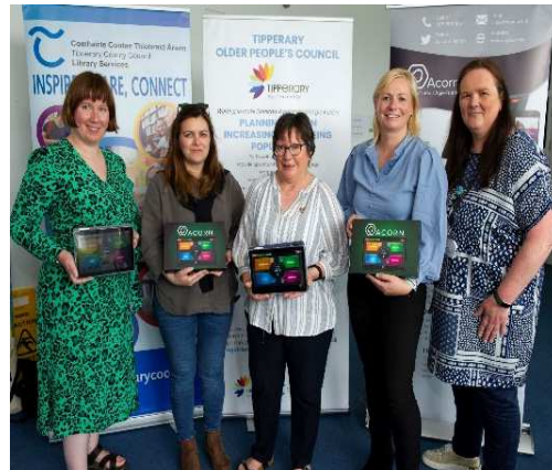
Dementia Library Referral