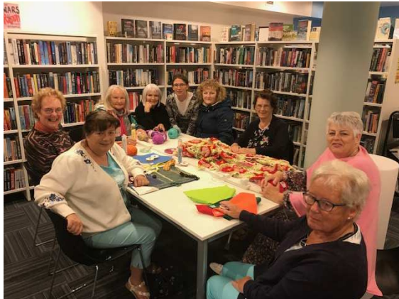
Craft Group Tipperary Library Programme