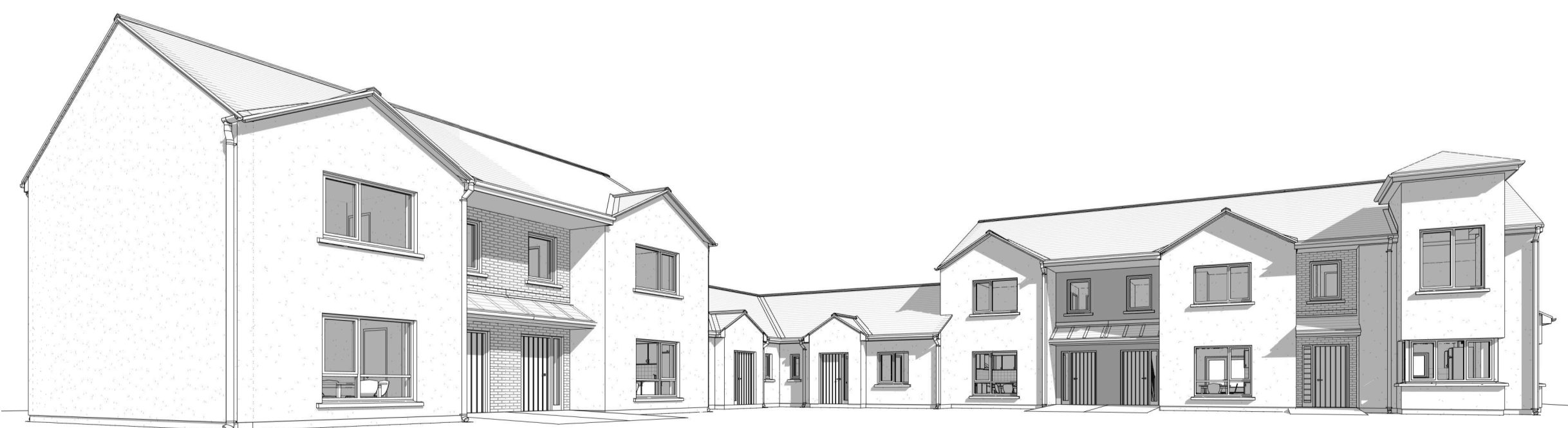
2 3D View

Note: To be read in conjunction with both structural + mechanical/electrical engineering details + specifications CPR Note: All works to be carried out using proper materials which are fit for the use they are intended and for the condition in which they are to be used. All materials used in connection with the works to comply with the Construction Products Regulation (EU) No. 305/2011 and the harmonised technical specification/standards that fall within the remit of the CPR No. 305/2011