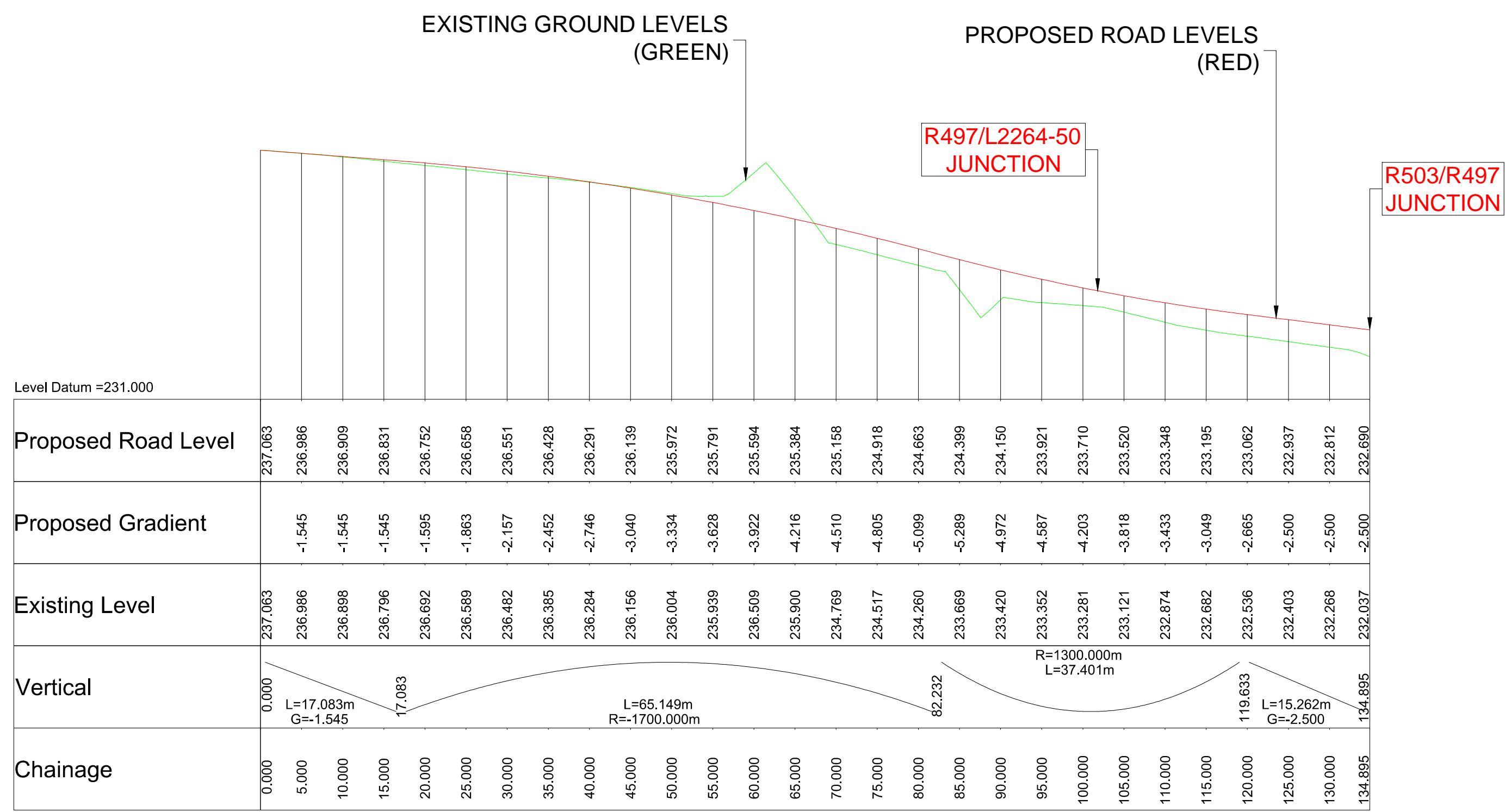
R497 (MC02) VERTICAL PROFILE (CH 0 - CH 134.895) HORIZONTAL SCALE: 1 : 500 VERTICAL SCALE: 1 : 100