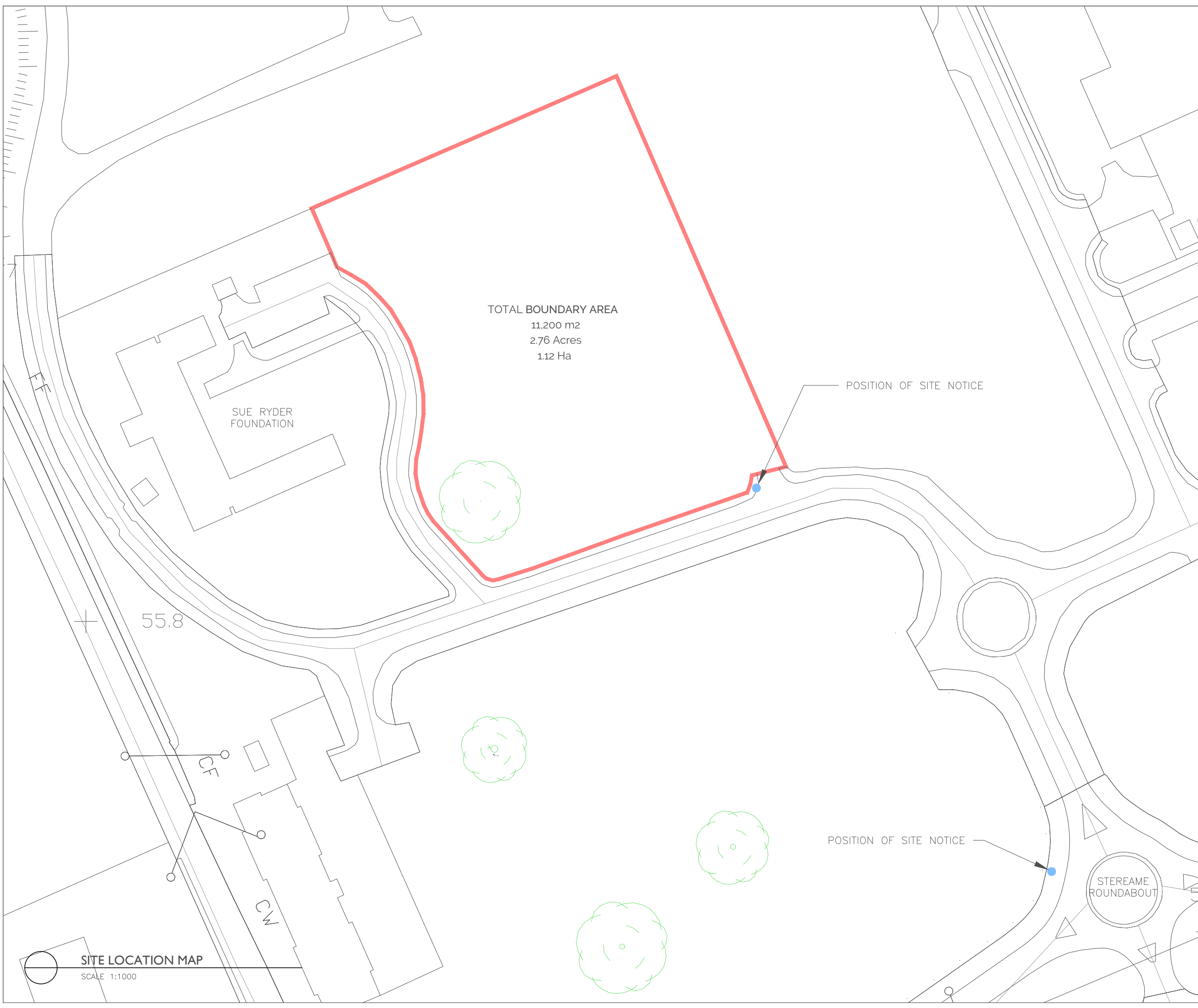
SITE LOCATION MAP SCALE 1:1000