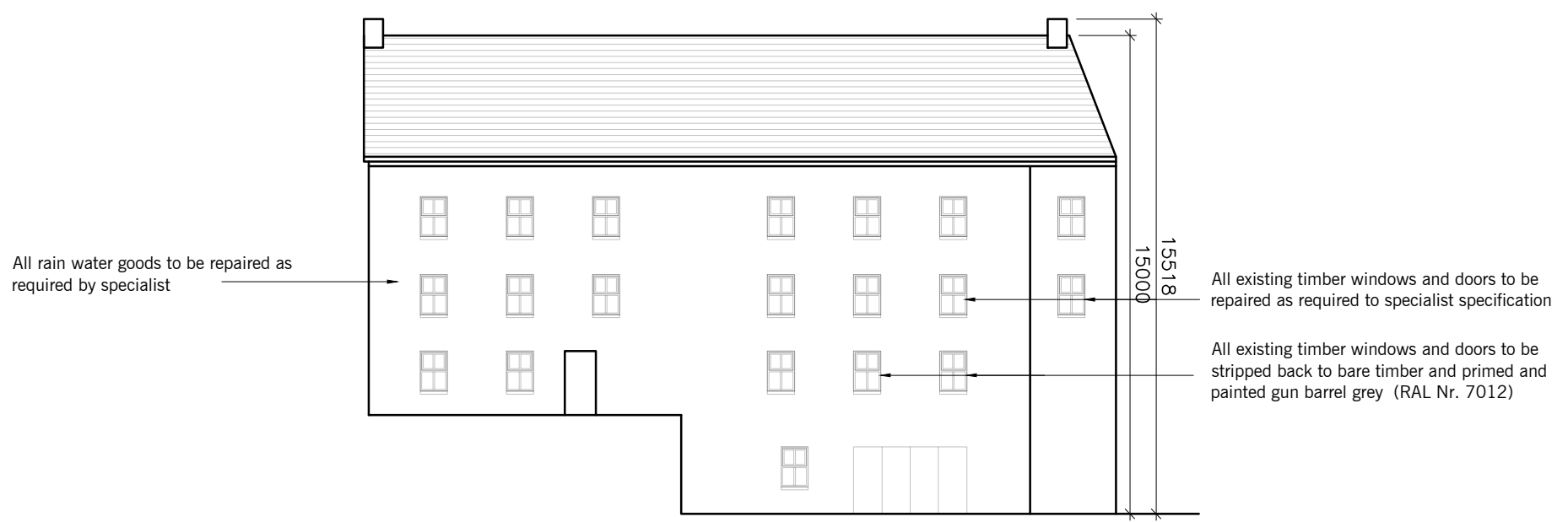
04 WEST ELEVATION 212 1:200