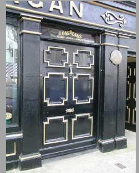
Primary Retail Area