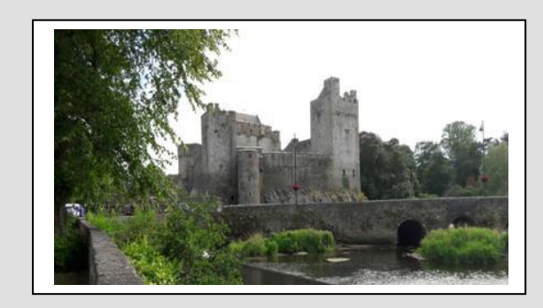
Making an application:

The applicant must indicate their legal interest in the property.