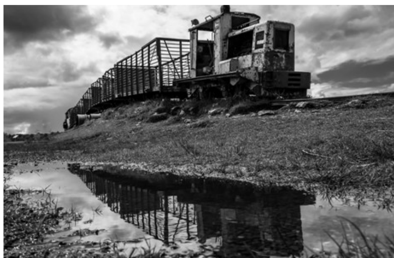
ART IN THE LANDSCAPE: FESTIVAL OF CHANGE Artist Proposals Invited

Please see details and submission link at https://www.offaly.ie/occ_news/tionol-art-in-the-landscape-festival-of-change/