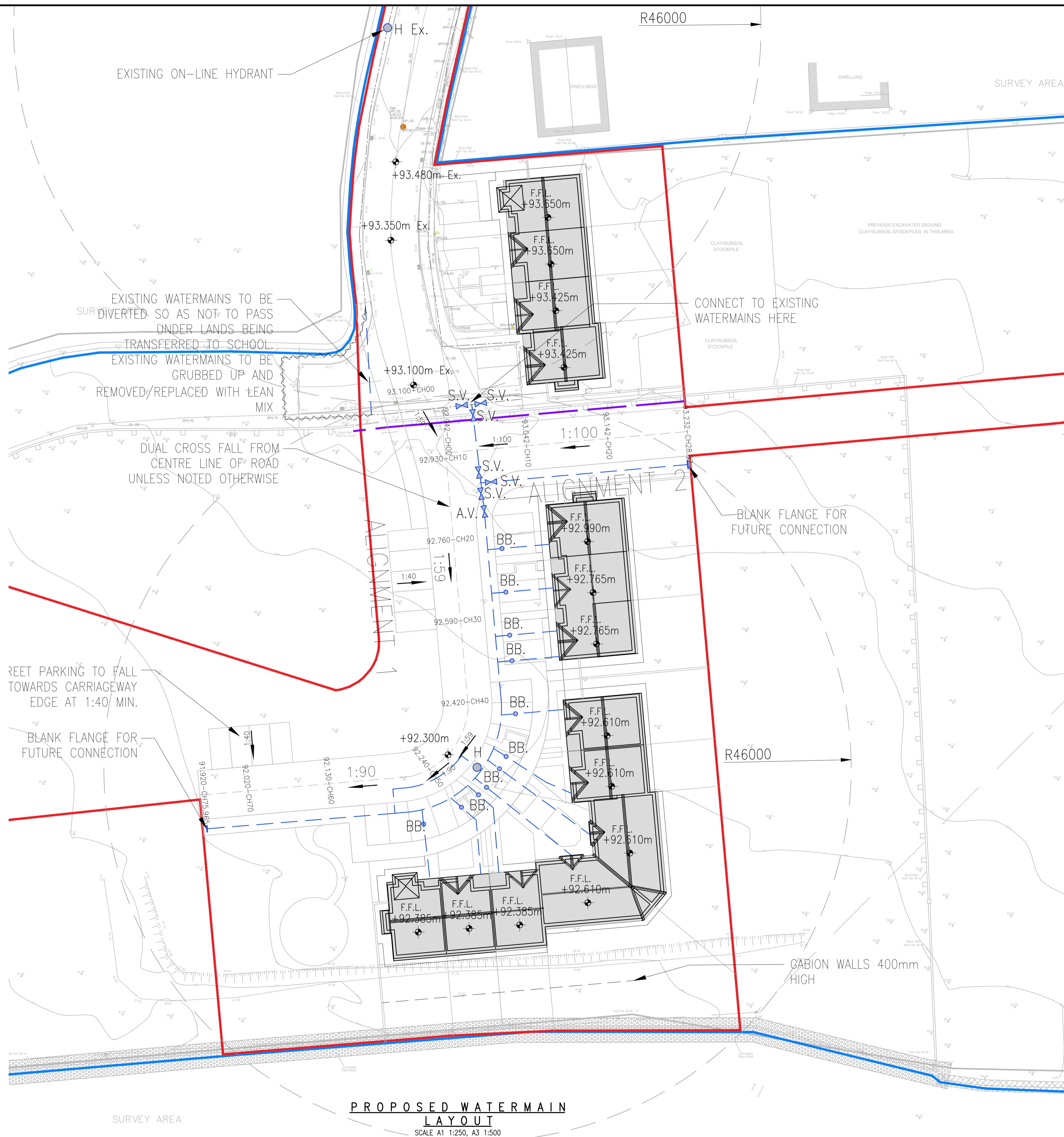
PROPOSED WATERMAIN LAYOUT SCALE A1 1:250, A3 1:500

NOTE: ALL INFRASTRUCTURE TO BE INSTALLED AND BUILT TO THE IRISH WATER CODE OF PRACTICE