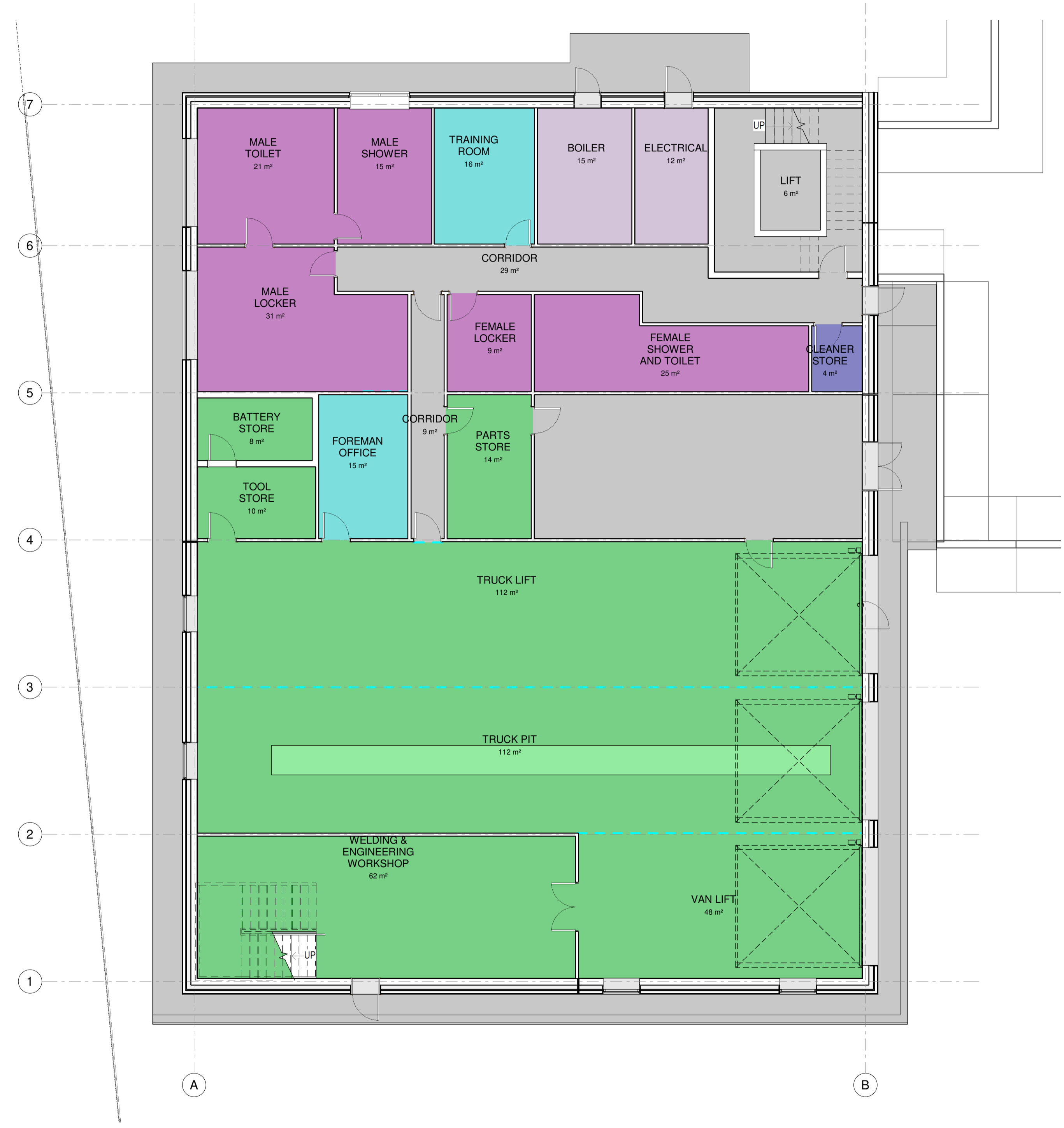
Level 0 - Ground Floor +58.528 SCALE 1 : 100