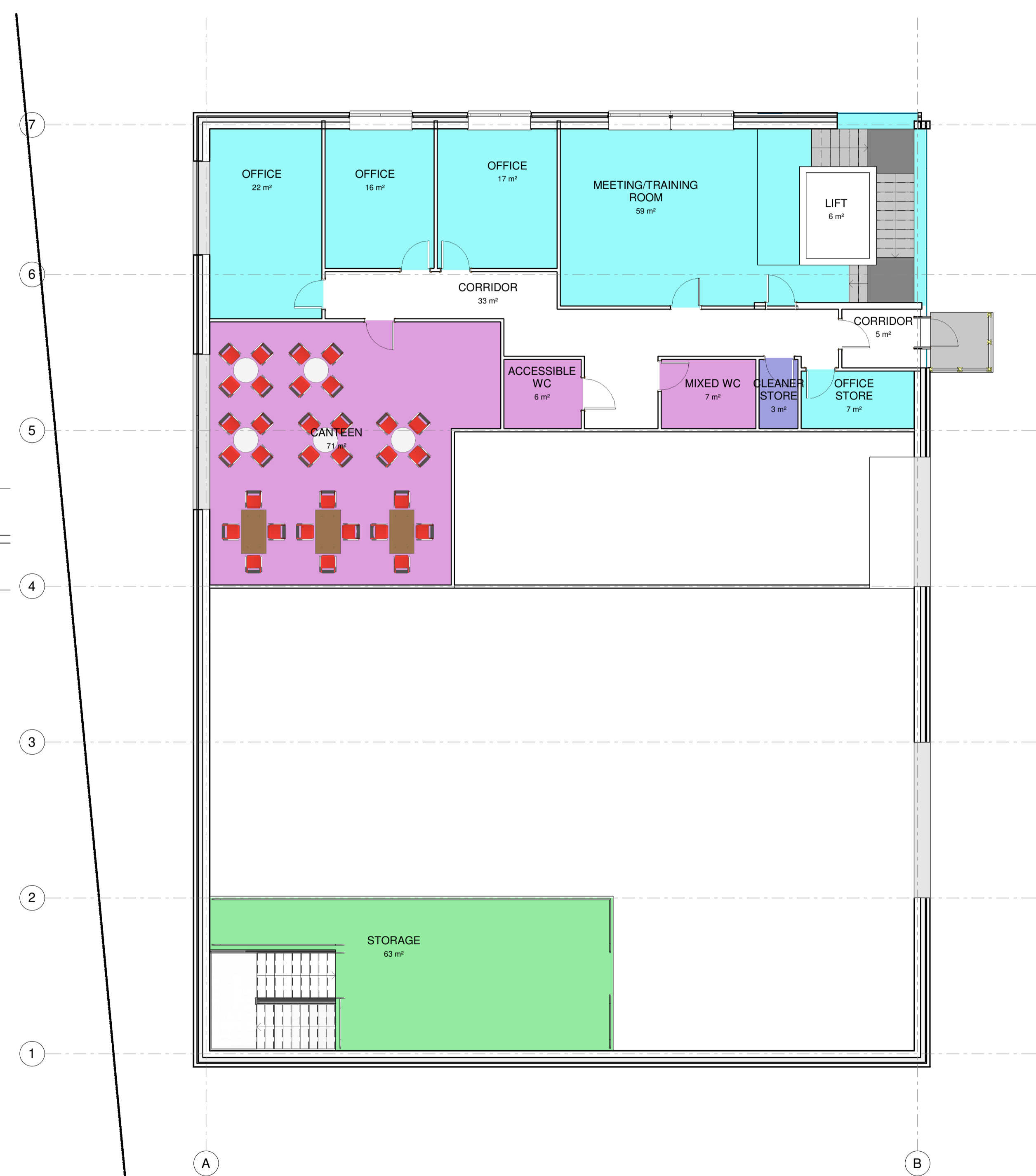
Level 1 - First Floor +61.528 SCALE 1 : 100