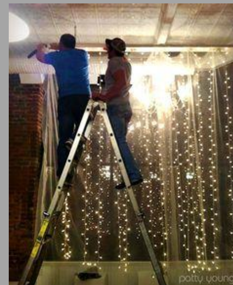
Primary Retail Area