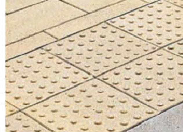
Blister tactile slabs Buff (400x400x100mm) at footway interchanges with pedestrian crossings.