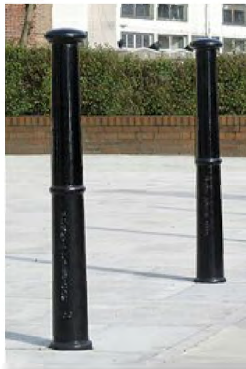
Removable bollards Cast iron, Furnitubes Brunel or similar