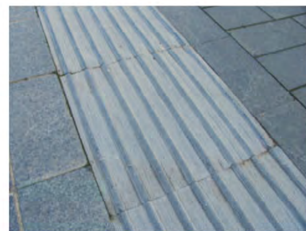
Corduroy Tactile Slabs Irish limestone (600x600x100mm) at interchanges between the raised table and the adjacent footway.