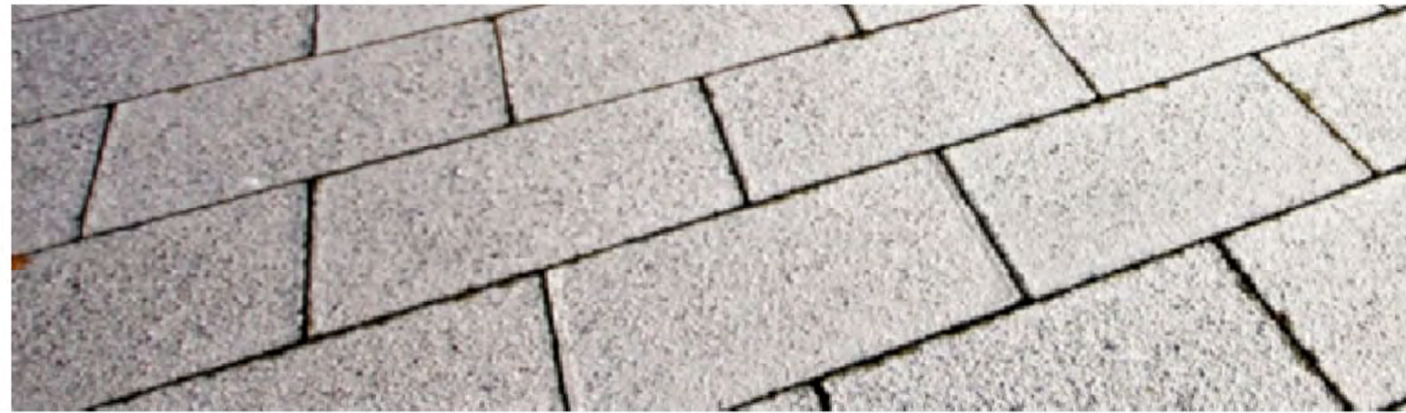
Footways Kilsaran Newgrange Silver Grey precast concrete slabs 600x300x80mm