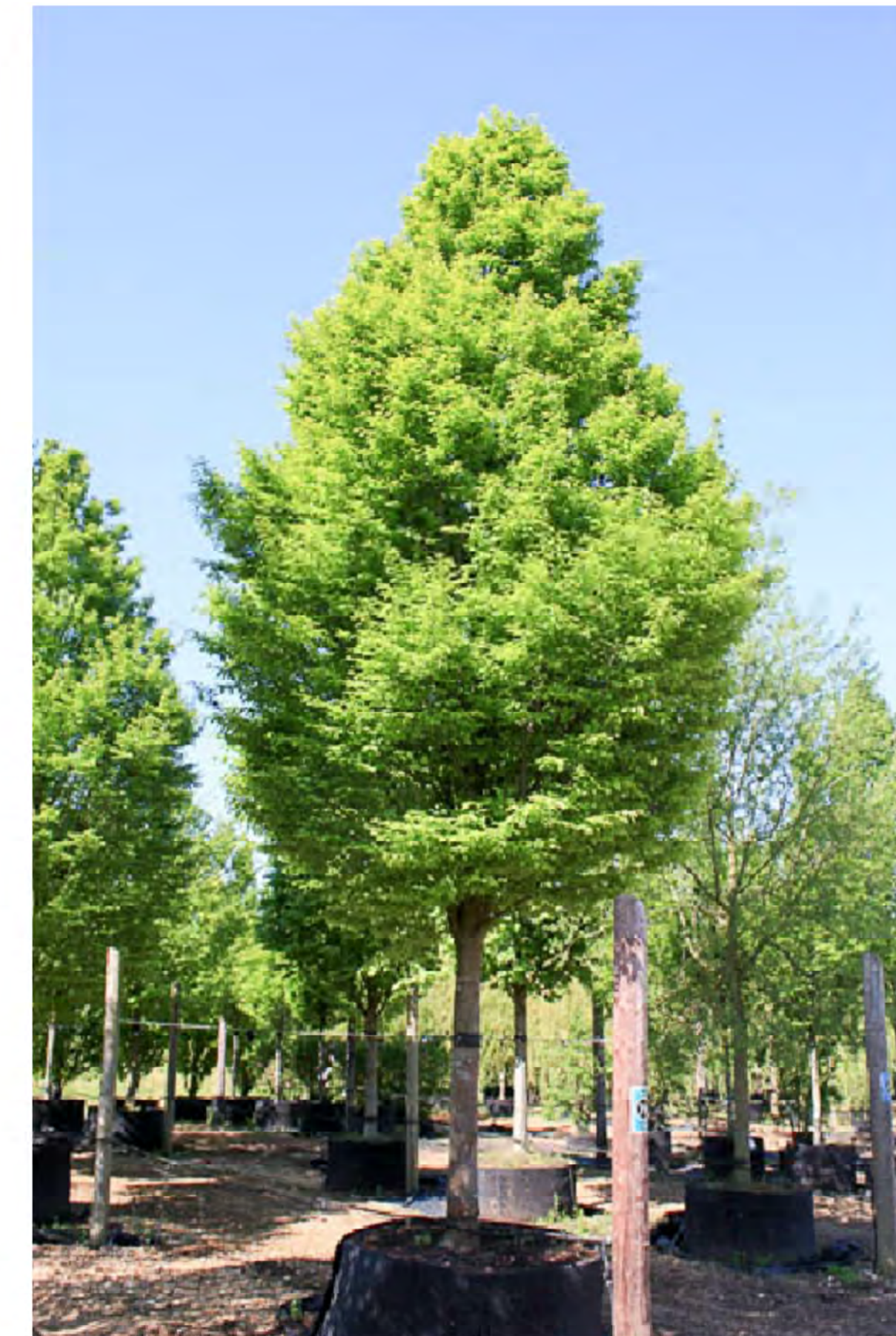
Carpinus betulus 'Fastigiata' Fastigate hornbeam