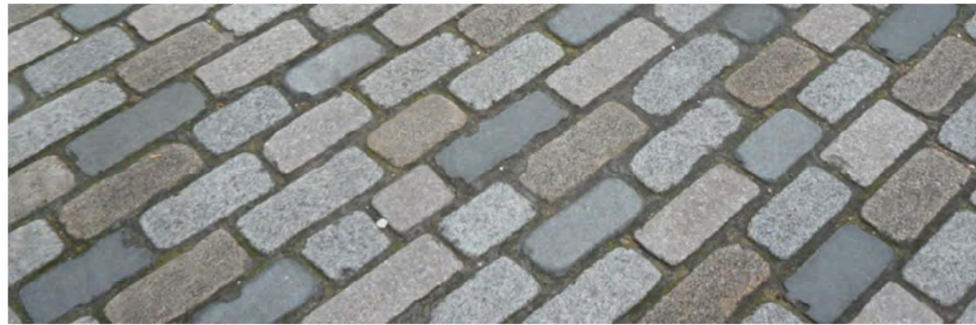
Shared surface areas and pedestrian courtesy crossings Granite setts 200x100x150mm thick, multi-colour grey granite setts. Rough texture top surface (possibly salvaged).