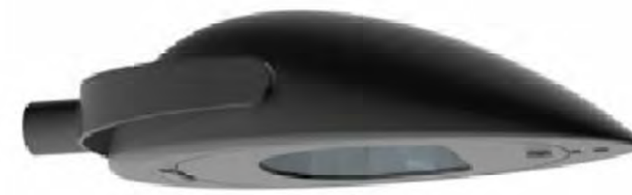
Street lights Modern Decorative Streetlight (385) on pointed bracket with pointed top Conical Lighting Column (804), Light.ie or similar to match the existing lights on Kickham Street.