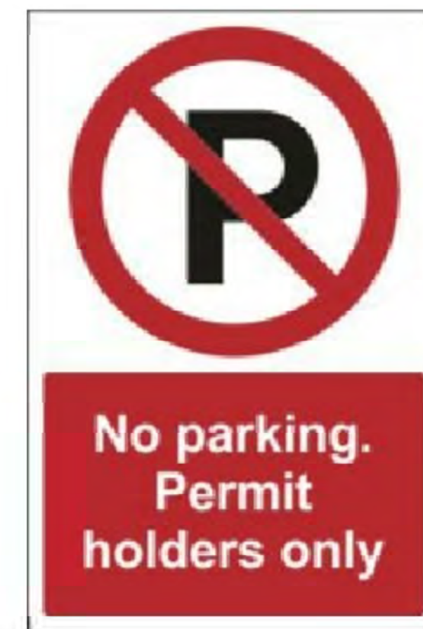
Typical prohibitive signing Junction of Castle Street and Castle Lane