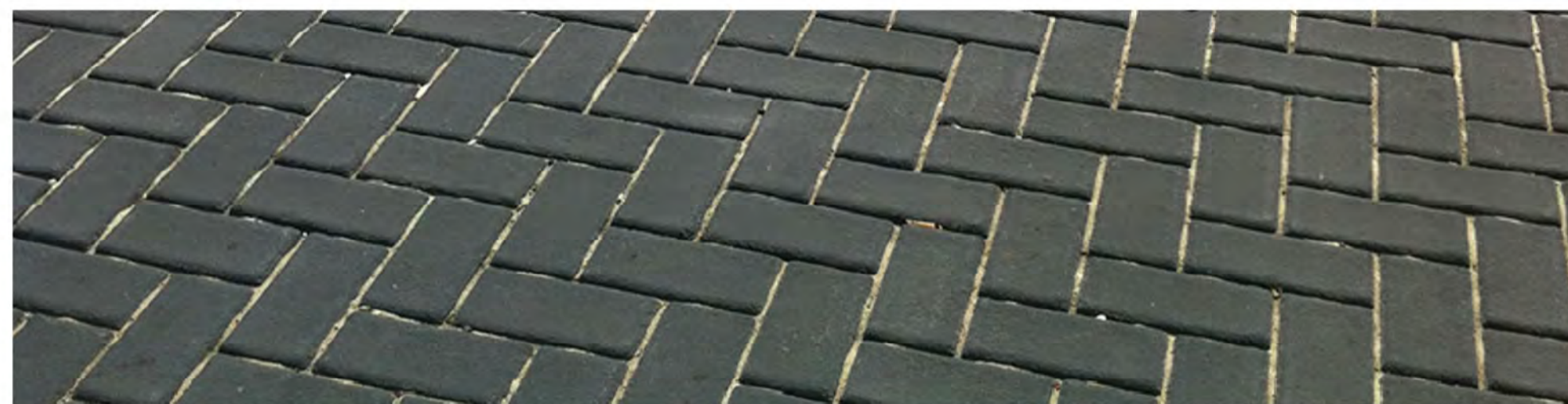
Raised table Imprinted asphalt