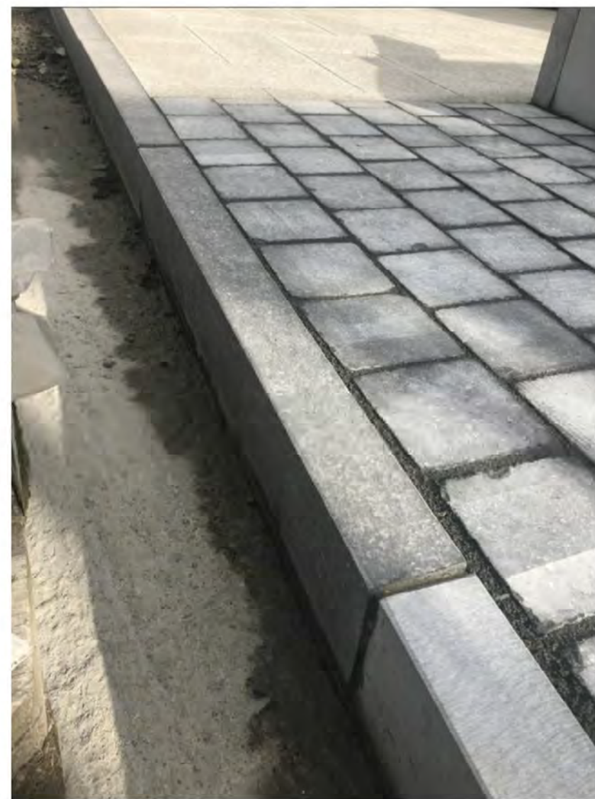
Kerbs Irish limestone kerbs 125x125mm